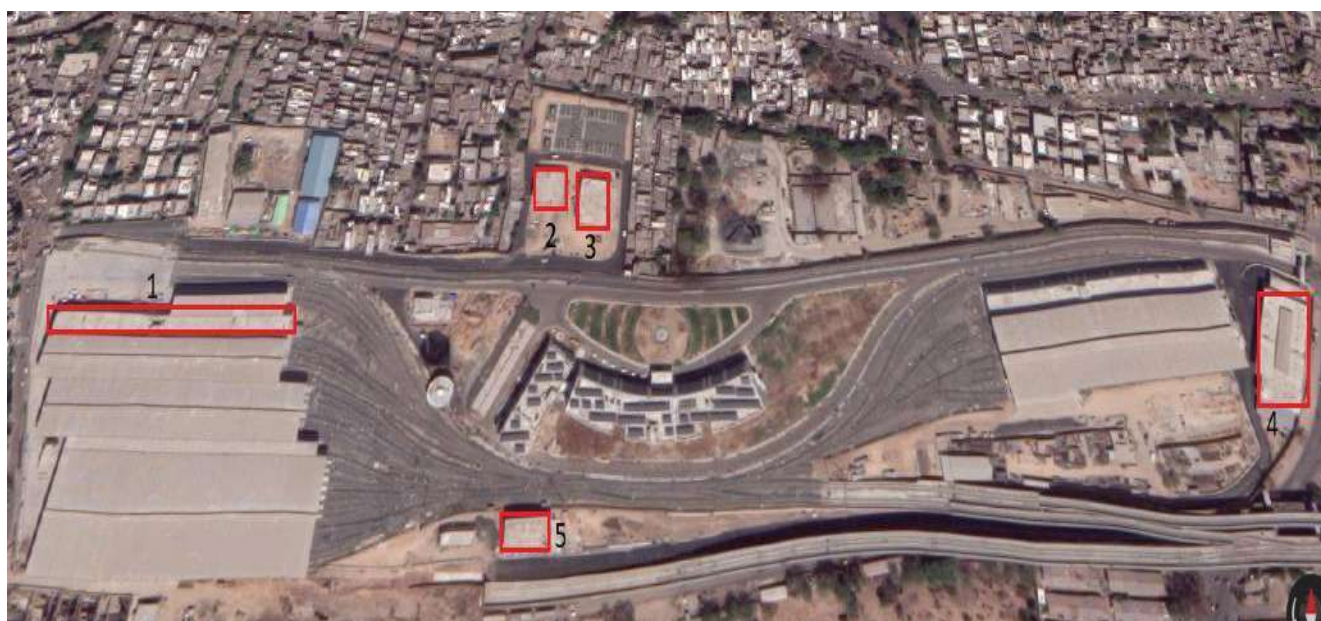
1. Maintenance/Inspection offices 2. RSS 3. ASS 4. Depot store 5. TSS